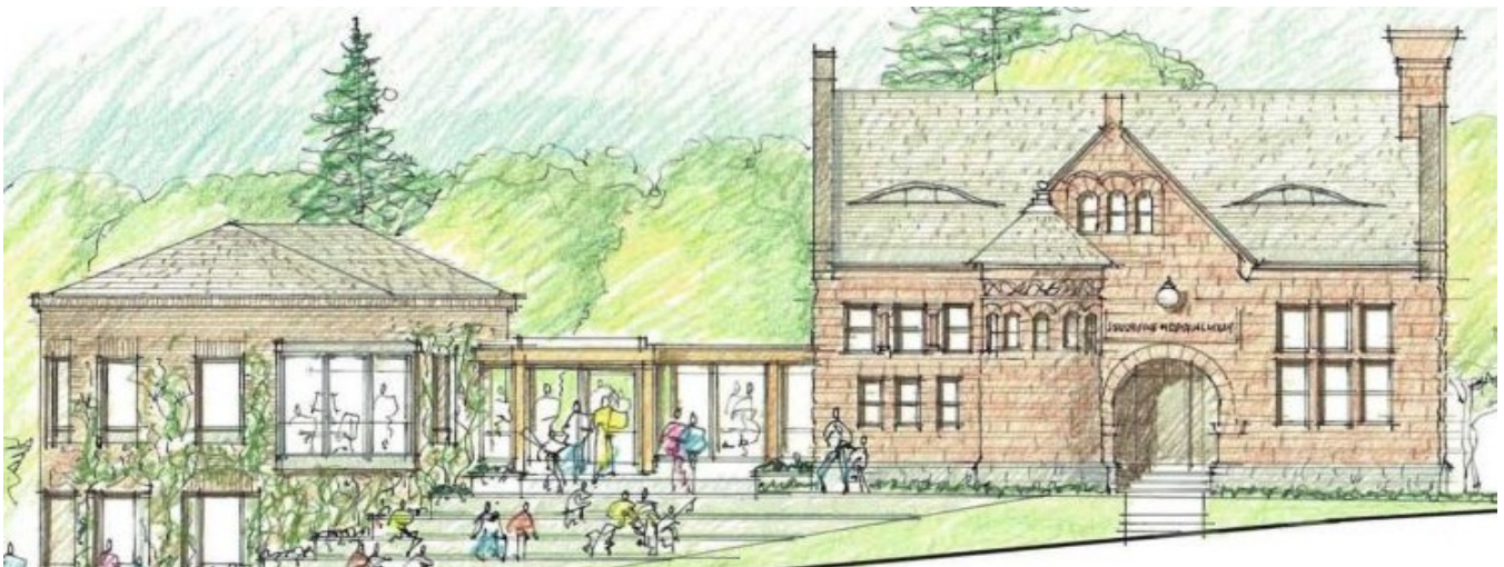
gbA Concept Design for Jeudevine Memorial Library