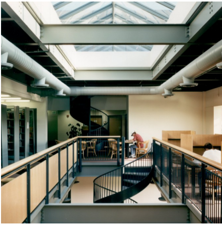
JSC Library and Learning Center

Many say we live in the Age of Information. We also live in a global environment where we have access to an almost infinite number of opportunities. The challenge we face is to make information and opportunities available to all people, and to facilitate an environment that does so while encouraging learning, community dialogue, and constant collaboration to improve the experience. Libraries, and especially community libraries, are the perfect entities to carry out this mission. As community hubs, they are accessible to a wide range of people, crossing socio-economic, political, and generational boundaries. It is this vision of libraries—as a communal space of learning and exploration for all—that we as an architectural studio strive to highlight in our designs.